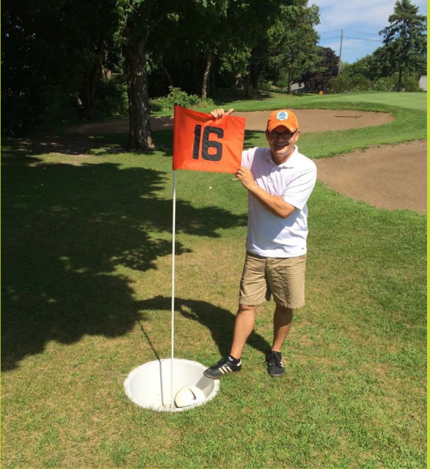
Hole-in-one at hole number 16 at Columbia Golf Club - Minneapolis, MN