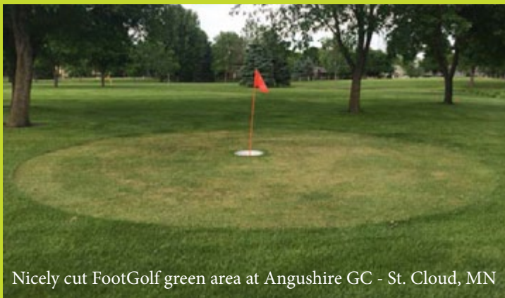
Nicely cut FootGolf green area at Angushire GC - St. Cloud, MN

FootGolf green locations vary greatly, depending on the golf course layout. We do like to have a “green” as well. Not so perfect as golf green, but close enough. Having grass cut to a shorter length, fairway cut is perfect. Some holes are located on the fairways, in the rough, some are off fairways, allowing the maintenance crew an easier path to mowing. There are no regulations as far as how big the FootGolf green should be. It is left to the golf course designer or FootGolf course designer.