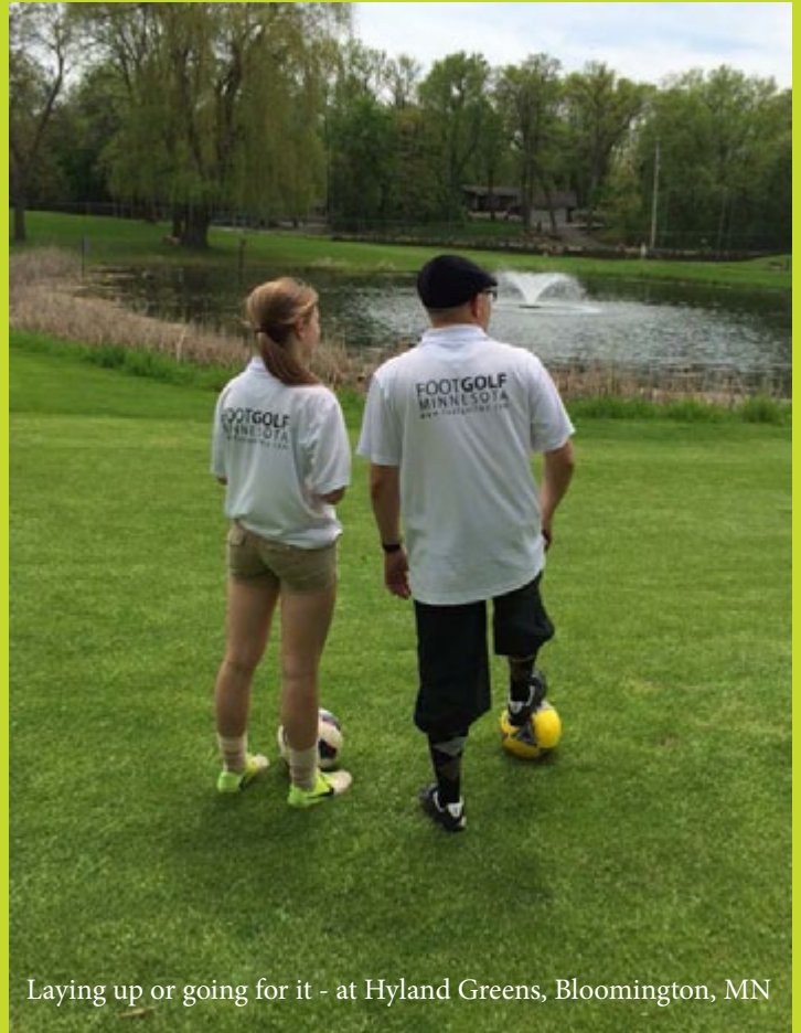
Laying up or going for it - at Hyland Greens, Bloomington, MN