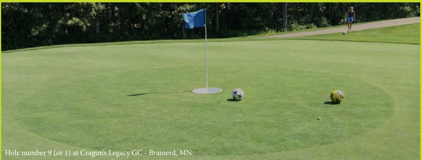
Hole number 9 (or 1) at Cragun's Legacy GC - Brainerd, MN

The first time I played that hole after returning to Cragun's last summer, I remained there, after our round, for at least 20 minutes just putting to that hole. My kids were getting antsy to leave, but I kept saying: “One more putt!”. They finally had to steal the ball from me to make me leave.