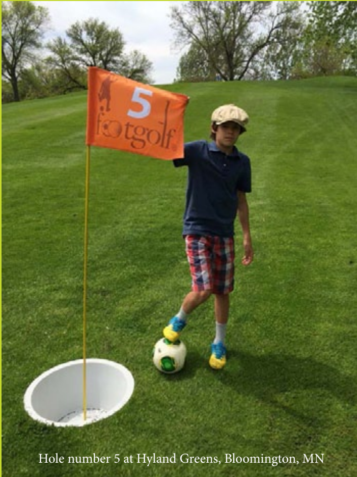
Hole number 5 at Hyland Greens, Bloomington, MN

I met some South American FootGolfers during various FootGolf tournaments, who will search the internet for a specific kind of ball, which they claim can gain them a few yards as well as make their putts go in. Since they have been winning most tournaments, there must be something there!