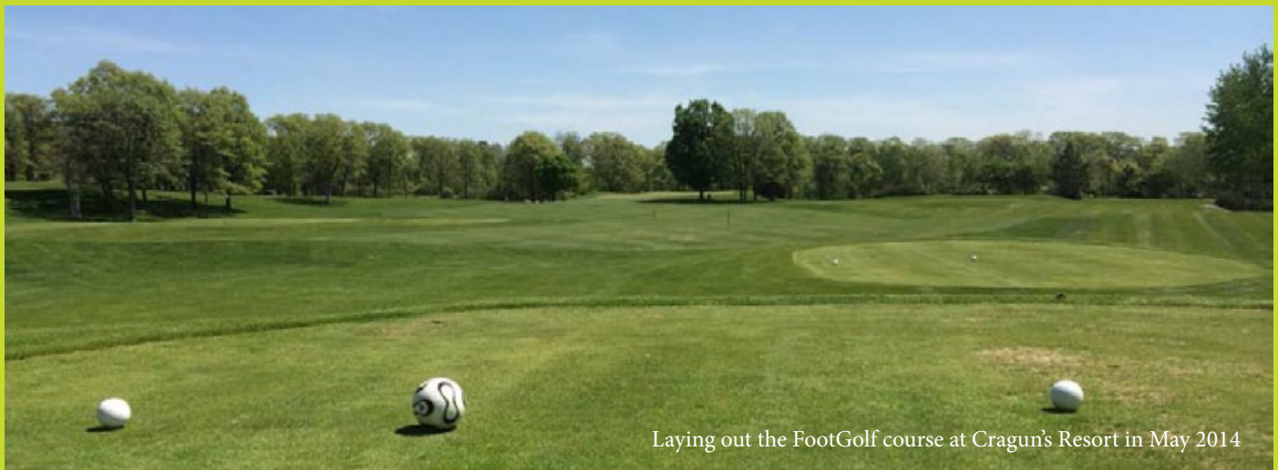
Laying out the FootGolf course at Cragun's Resort in May 2014

I have been asked that question many times in the last year or so and I am happy to report that the answer is an enthusiastic YES!! As this new and exciting sport is taking over the world, our local golf courses in beautiful Minnesota are not far behind. As of mid-October 2014 we can proudly say that we have over 264 FootGolf courses in 41 US states and 10 in Minnesota. When I say we, I mean American FootGolf League (AFGL), which is responsible for bringing this sport to the US, as well as overseeing the development of it in this country. What I admire the most about AFGL is the insistence on featuring FootGolf ONLY on existing golf courses. So, FootGolf is not competing with golf, but living in a special symbiotic relationship with golf, because if you ask yourself the question what FootGolf is, the simple answer is GOLF, but with a soccer ball. We follow the exact same rules and etiquette as golf and our dress code is closely related to traditional golf attire – think Payne Stewart. We do have bigger balls (!) and use our built-in clubs (feet), but that is where the differences end and similarities begin. We got pars, birdies, eagles and yes, hole is ones!!