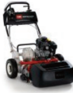
Greensmaster® Flex™ 1800 (04041)