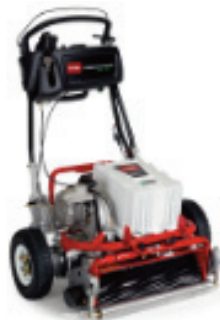
Greensmaster® eFlex® 2100 (04042)