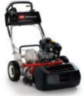
Greensmaster® Flex™ 2100 (04040)