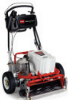
Greensmaster® eFlex® 1800 (04043)

Toro offers many Roller Options, Roller Extensions, Clip Kit, Groomer, Groomer Brush, Scrapers, Bedknives and more.