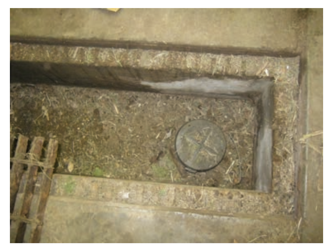
Above: Acceptable storage with drain plugged to protect the environment

Are small package pesticides safeguarded as required by the label?