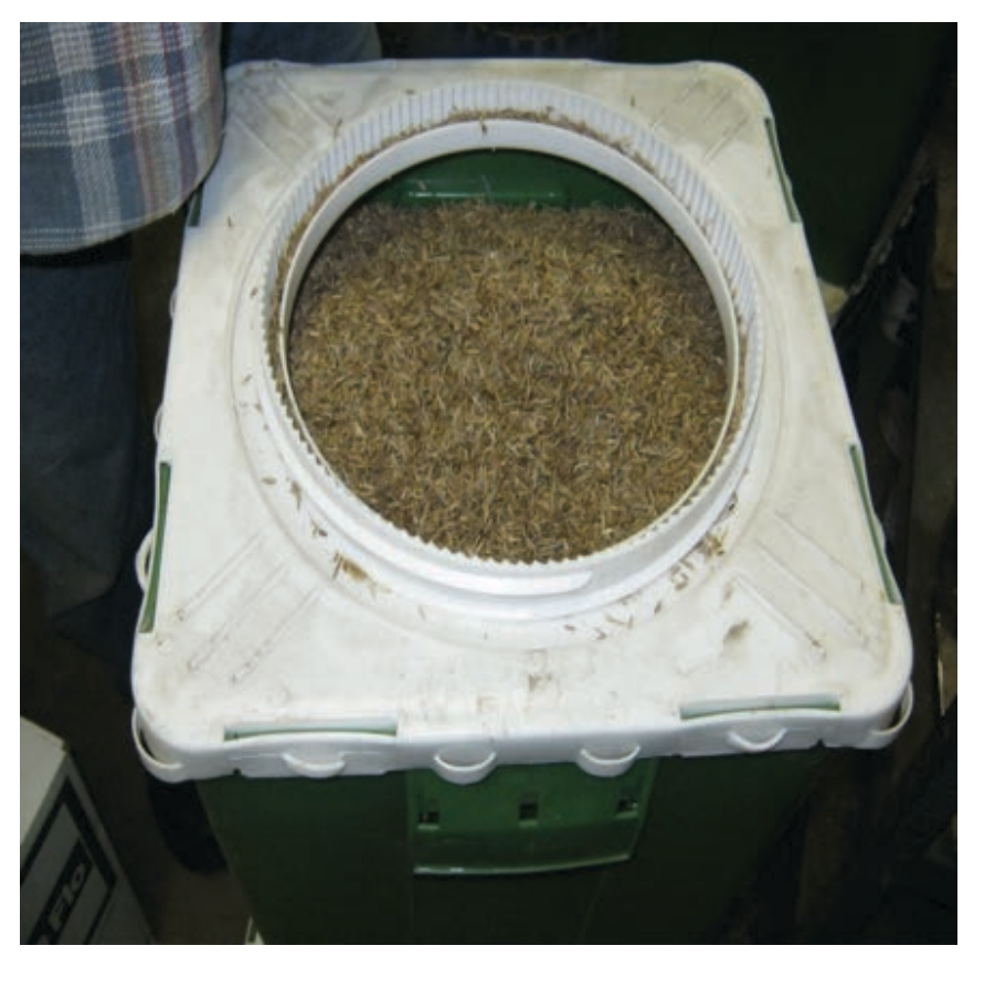
Above and right: Unacceptable re-use of pesticide containers.

According to the label, pesticide containers cannot be used for other purposes.