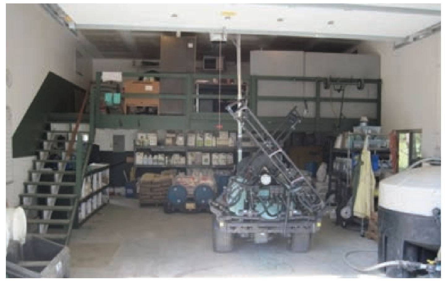
Above: An example of a great storage facility Are wells safeguarded from pesticides in storage?

Individual pesticide containers with a capacity of 25 gallons, or 100 pounds or more must be stored at least 150 feet from a well, unless additional safeguards are provided. Information on additional safeguards which may reduce this setback can be obtained from: