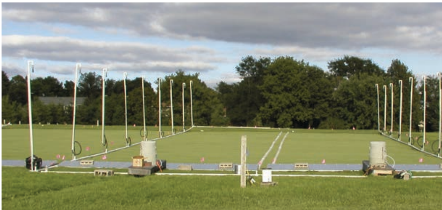
Figure 3. A rainfall simulator deliver precipitation resembling storm intensities recorded in Minnesota, USA. Runoff collection gutters guided runoff from the turf to flumes equipped with automated samplers and flow meters. Gutter covers and flume shields prevented dilution of runoff with precipitation.

of that area represented by fairway turf. Estimated pesticide concentrations in a pond receiving runoff from fairway turf managed with solid tine or hollow tine core cultivation were compared to published toxicity data to evaluate which core cultivation practice would be the most efficient at reducing environmental impacts. A detailed description of the calculations, toxicity data and statistical analysis are provided elsewhere (28).