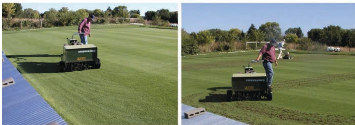
Figure 1. Creeping bentgrass turf managed with solid tine (A) or hollow tine (B) core cultivation. Cores removed with the hollow tines were air dried and worked back into the turf prior to pesticide application and simulated precipitation.