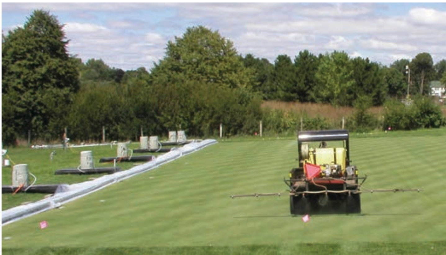
Figure 2. A commercially available insecticide, fungicide, and herbicide were tank mixed and applied at label rates to all plots perpendicular to runoff flow; 63 d and 2 d following core cultivation and 26 \pm 13 h prior to initiation of simulated precipitation and runoff.

Runoff collection systems were constructed at the western end of each plot, modified from the design of Cole et al. (21). Water traveled from the runoff gutter to a stainless steel flume equipped with an automated sampler and flow meter. Gutter covers and flume shields prevented dilution of runoff with precipitation. Plots were hydrologically isolated with removable berms.