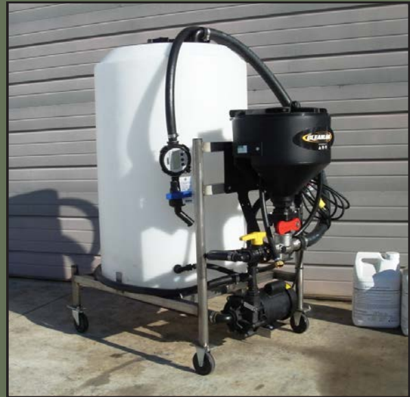
Chemical Pre-mix Station