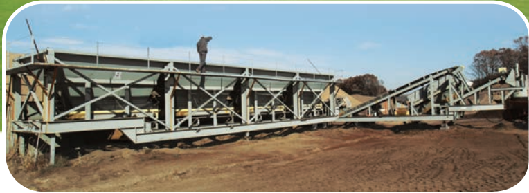
The Legends at Giants Ridge