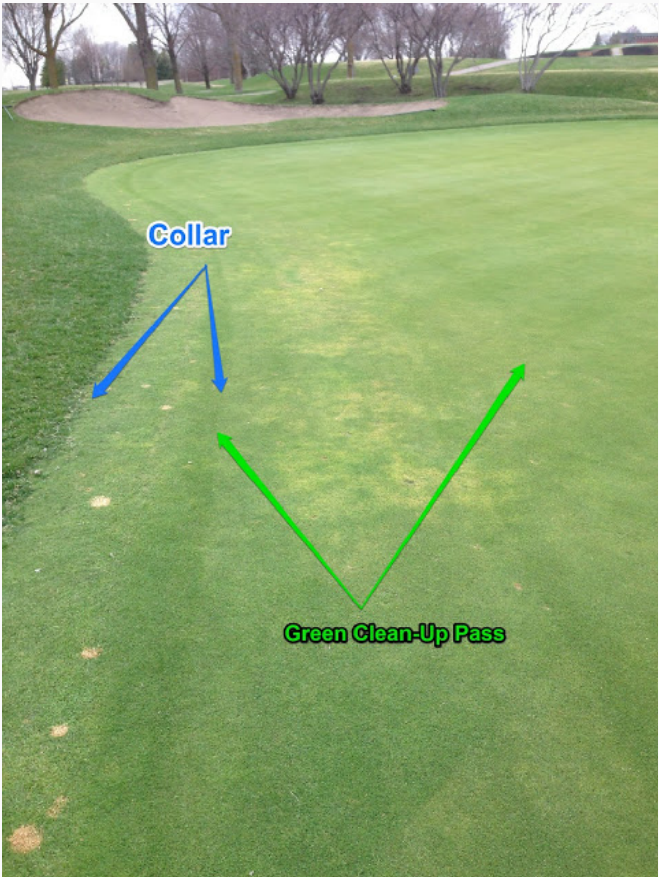
These are the areas which make up the putting surface perimeters. This photo was taken about two weeks ago; the yellowish turf was a bit week coming out of winter. Cultural and nutritional practice since, have this turf looking much healthier.