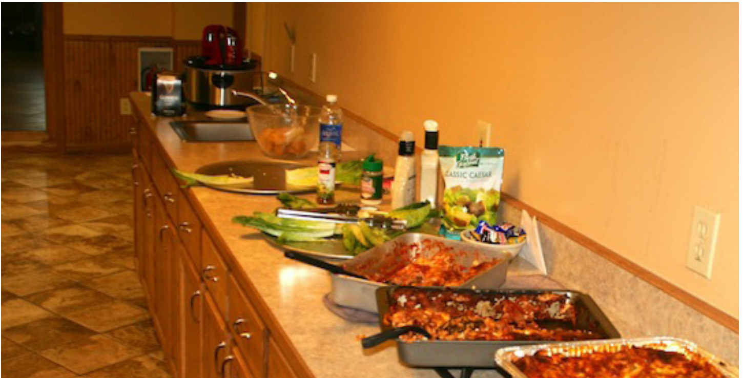
Hard work made for hearty appetites!!! The MGCSA Board of Directors feasted on home-made lasagna.