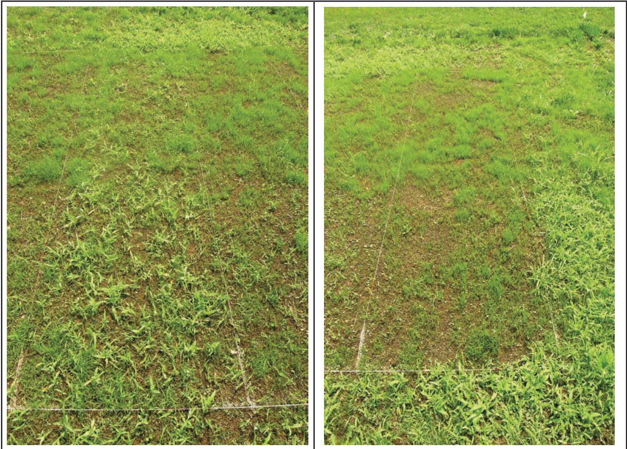
Figure 3. Control of crabgrass, goosegrass, yellow foxtail, yellow nutsedge, pigweed, and purslane was nearly 100% when Tenacity herbicide was applied at seeding. Perennial ryegrass was seeded into the area, lightly incorporated and then Tenacity was sprayed over the top on July 25, 2007. Photographs taken on August 8, 2007 (14 DAT)