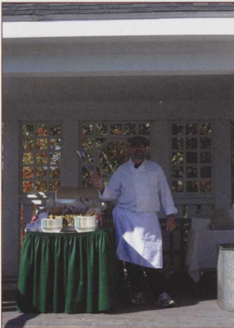
THE BRATWURST COOK AT THE WEE ONE GOLF FUNDRAISER