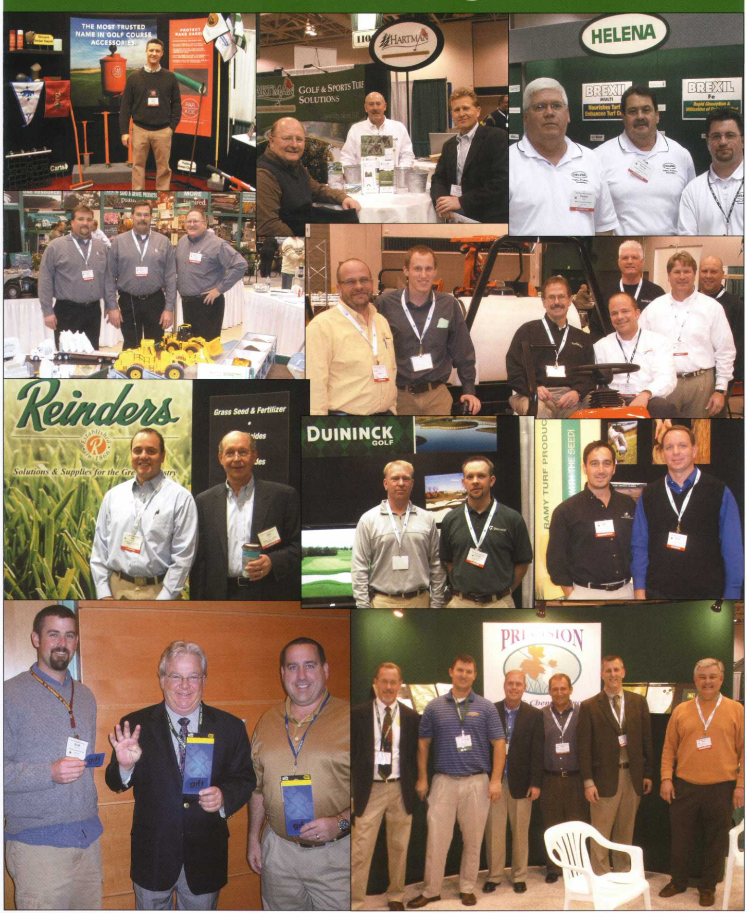
22 January / February 2010 Hole Notes