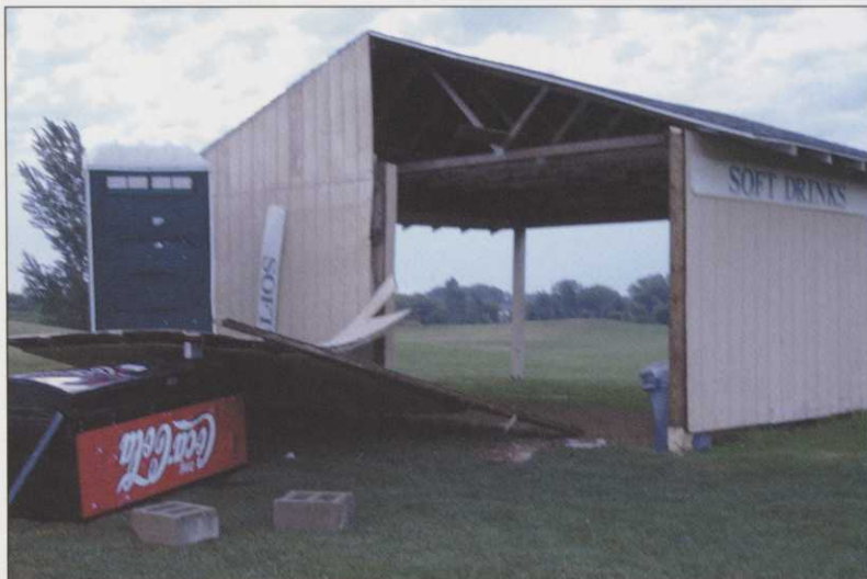
Shelter damage at Heritage Links Golf Club - Paul Eckholm, CGCS