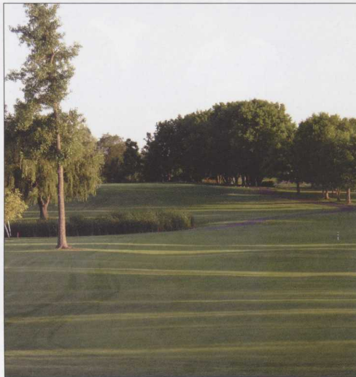
No. 11 at Pheasant Acres Golf Club

The biggest overall challenge facing the maintenance crew is the heavy clay soil underlying most of the playing surfaces. This poorly draining soil results in several bunkers having to be pumped and numerous low spots having to be mowed around