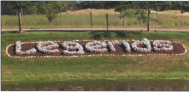
Above is a flower arrangement at The Legends. The photo below was taken at Somerset Country Club.