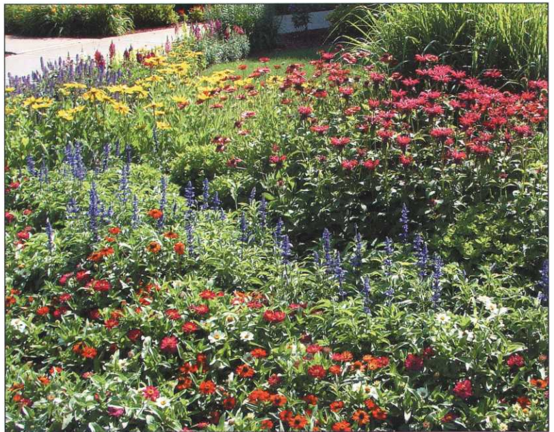
The flowers above are near the TPC Twin Cities golf shop entrance,. The flowers below are at Dakota Ridge.