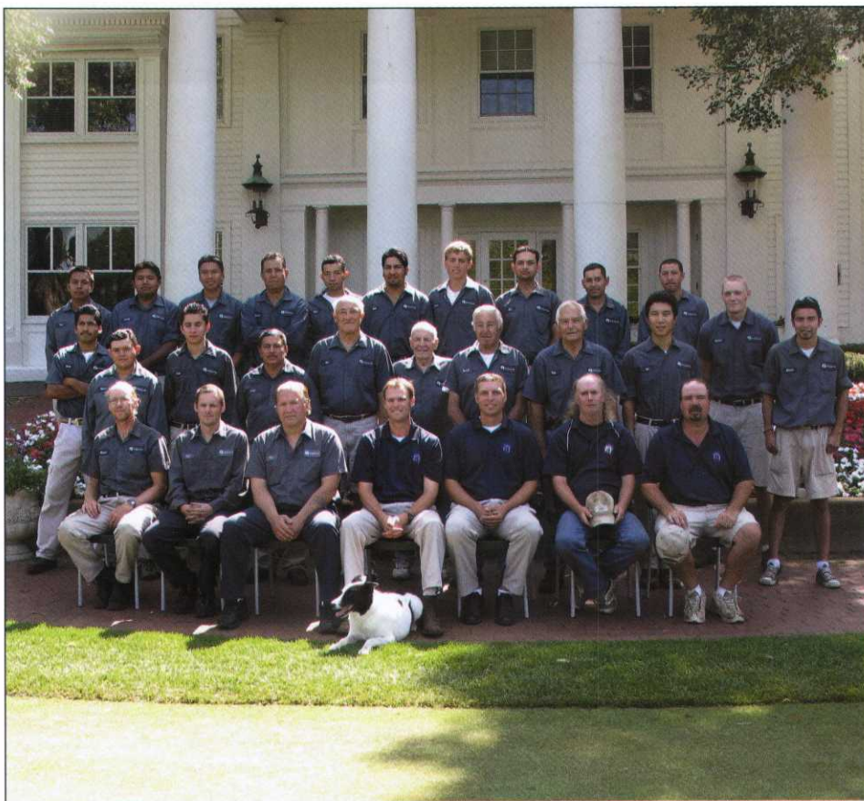
The Grounds Staff at The Minikahda Club