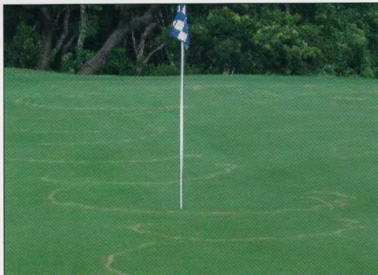
Vandalism on the greens of Hong Kong Country Club