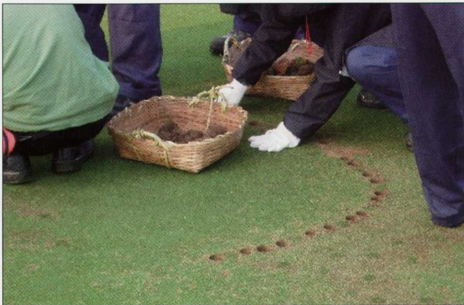
Repairing vandalism on 12 of 18 greens of the Old Course at Hong Kong Country Club.

My initial diagnosis was that a product such as Round Up had been poured on the greens. Members of my staff confirmed that this type of product is readily available for purchase in Hong Kong and surrounding villages in the New Territories where we are located. As most superintendents are prone to do, we held out hope that the plants would only suffer superficial damage, which would not prove to be a problem in the long term. We had just come through a period of wet weather so we hoped that maybe the product had been washed off of the affected turf to the point where the turf would eventually recover. We always have hope, right? How many of us have looked for and seen real or imagined signs of life in winter-damaged turf? It is amazing how many young turf plants we can see or imagine in the late afternoon on a sunny