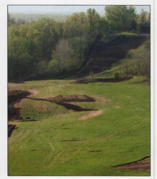
Third green river valley view after clearing.

To meet the demands of today's golfers, the course needed a complete re-design including multiple tee boxes for each hole, 6,000 square foot greens, a two-acre irrigation pond and a double-row irrigation system. The catch is that the work cannot dis-