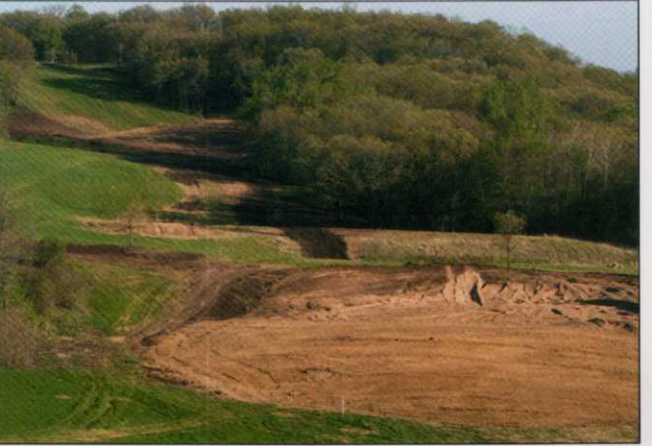
Rough grading of first and second hole at Fort Ridgely.

Preservation of artifacts was additionally difficult since many artifacts were within a few inches of the surface. "Four of the five holes had artifacts so close to the surface that we were not allowed to disturb the topsoil," said McDowell. "In order to level the fairways for modern mowers, we had to import a thin layer of