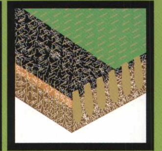
PlanetAir's "high density" hole pattern combined with our patented planetary motion - allows you to achieve the most intense aeration in the industry.

For more information or to demo a PlanetAir, call your Turfwerks representative, or dial 1-800-592-9513