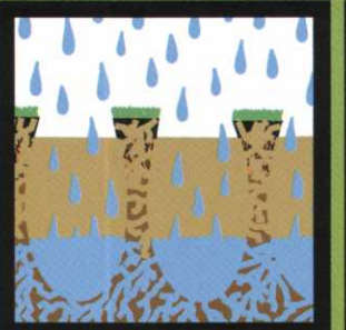
Maximizes water infiltration rates by allowing water to penetrate the soil profile at a faster rate.

Our patented coring tine technology - combined with our planetary motion - cuts clean cores at the surface and shatters the soil below. This promotes better soil structure with less cleanup.