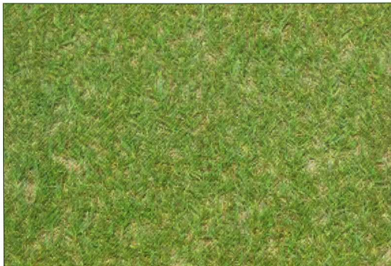
Bermudagrass on a putting green at Hong Kong Golf Club.

Maintaining a high level of Ca is essential for health and good disease control. During the hot, wet summer months, it is not unusual to apply a fungicide about every 5 days for disease control and prevention. A heavy application of topdressing seems to trigger the onset of leaf spot rather quickly. I attribute this to the