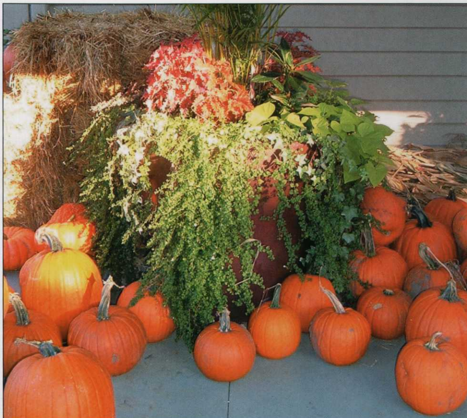
Volleyball Gardens Guys and Dolls