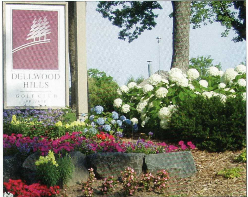
Flowers greet members, guests and staff as you enter Dellwood Hills Golf Club.

White Bear Yacht Club is a seasonal club; the main clubhouse is opened from May through September. The Golf House and golf course remain open into late Fall. White Bear Yacht Club has recently built a new clubhouse, as well as, a new Golf house, so many of the landscapes were updated along with the new buildings. In addition to gardening, Linda creates cut flower arrangements for the clubhouse and the Golf House, and has a budget of $7,500 for cut flowers. The flower arrangements are supplemented, when possible, with outside plant material from the gardens and landscapes. The gardens