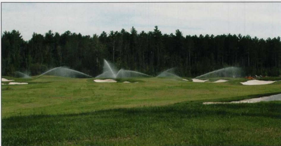
Ely Golf Club

Another common and often overlooked problem associated with lack of sufficient water flow in your system is garbage clogging up your "Y" strainer. It is a good idea