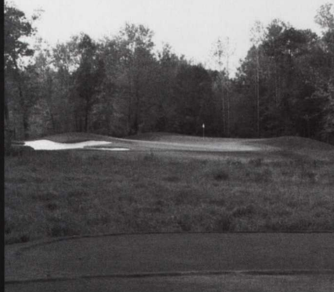
163 Yard Par 3 eighth hole at the Refuge Golf Club in Oak Grove, Minnesota.

(Editor's Note: These articles are Copyright (c) 2003, Chicago Tribune and reprinted with permission.)