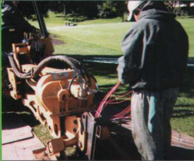
new course Construction

Providing Quality Golf Course & Athletic Field Irrigation