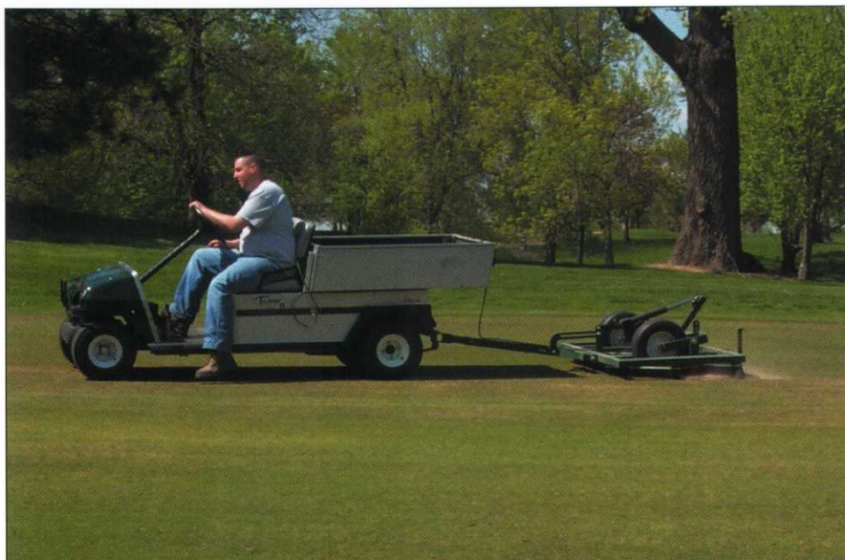
Filling the grooves with drag brush.

In 1998, we began sending undisturbed soil cores to the International Sports Turf Research Center (ISTRC) in Olathe, Kansas for physical soil analysis. We tested the worst USGA green, #2, against one of our better USGA