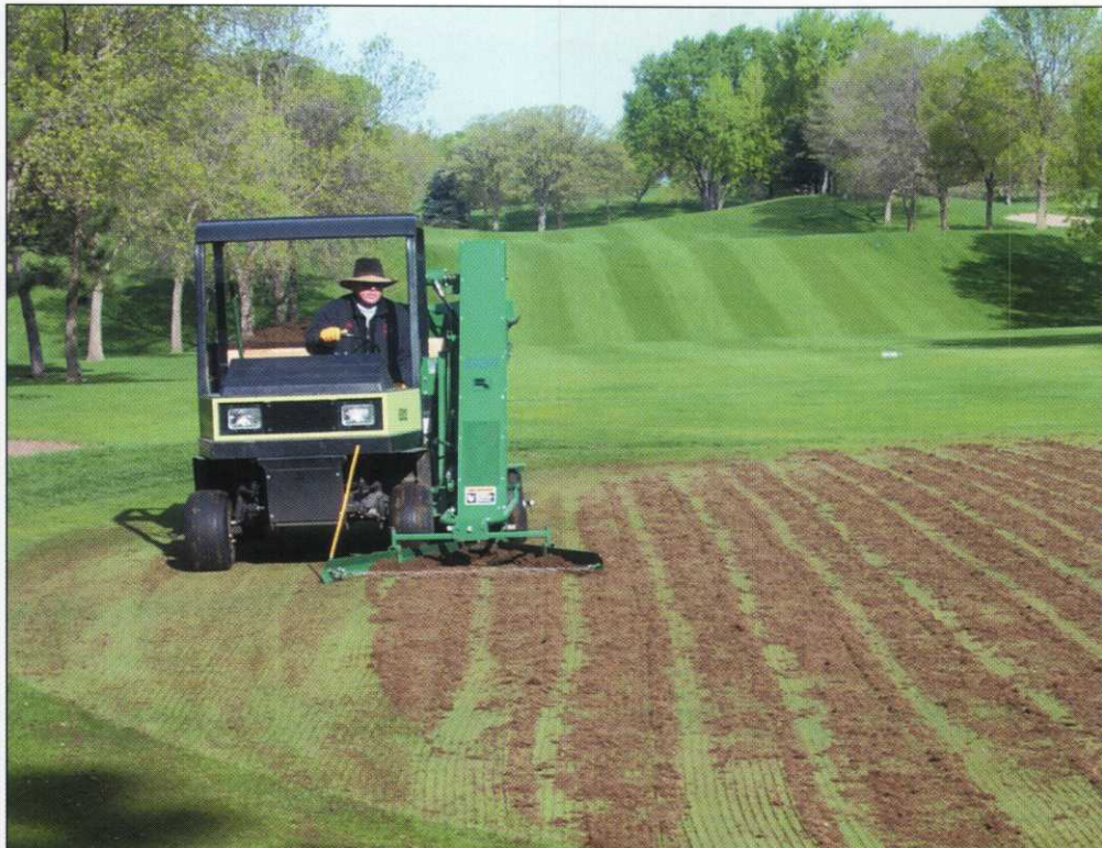
Cleaning up the mess.

Deep vertical mowing is surely not a replacement for core cultivation. We intend to core cultivate a minimum of one time per season in the years ahead. Deep vertical mowing is simply another tool to help you deal with organic accumulation and poor physical soil properties that can occur when growing bentgrass on sand-based greens. But the greatest benefit, in the eyes of a golf course superintendent, is the good will this machine will spread for you...no holes equal happy golfers!