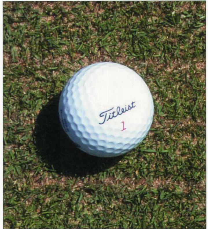
2mm Graden Slits Topdresser

Sodded greens can also benefit from the use of this machine if used early in the life of the green. Greens established from sod invariably have issues with layering, whether they are the result of thatch components in the original sod or incompatible root zone media. Aggressive,