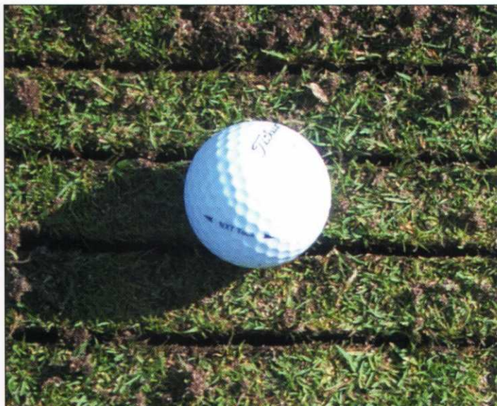
3mm Graden Slits

Here at Keller GC, we have been experimenting with the Graden unit for several years now. It was purchased with the original intent of addressing a layering problem in twelve "new" greens. Our problems began in 1990 when twelve greens were rebuilt to USGA standards during an under-funded golf course renovation (12 out of 19 rebuilt). As with most government purchases, low bid determines the vendor. The Penncross sod that was laid over the 80/20 greens mix was of poor quality. It was a mature, thatchy sod. On top of that, the soil that the sod was grown on was incompatible with the 80/20 greens mix. What followed has been years of weak root growth, poor internal drainage, and poor soil aeration, resulting in poor putting surfaces.