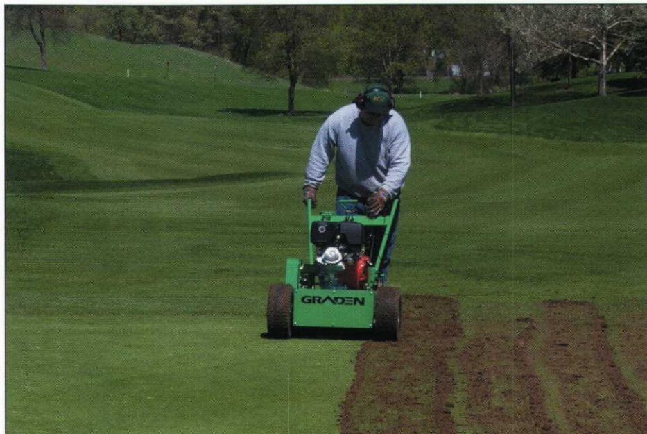
Graden in Action

+ Using the 3mm blades on one inch centers impacts approximately 14.1% of the putting surface. This compares to 4.9% when using 5/8" hollow tines on 2.5"x 2.5" centers. The 2mm blades impact 7.8% of the surface area. The 1mm blades impact 3.93%.