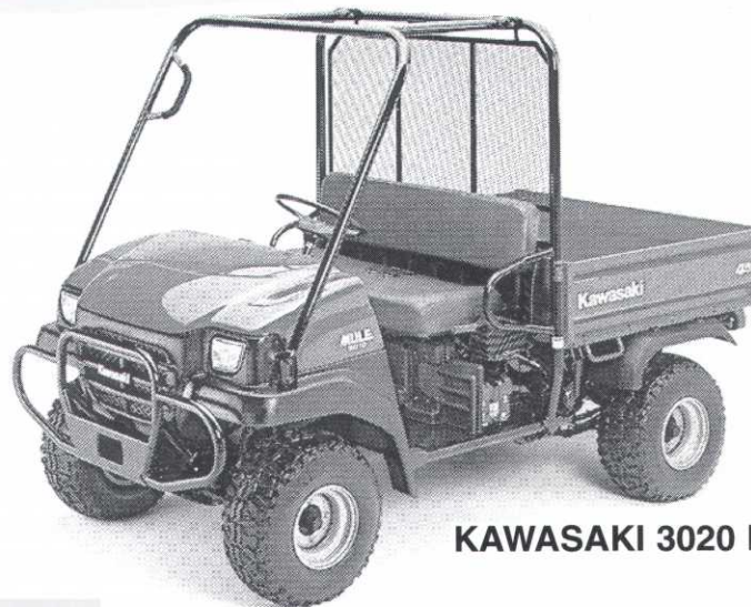
KAWASAKI 3020 MULE™