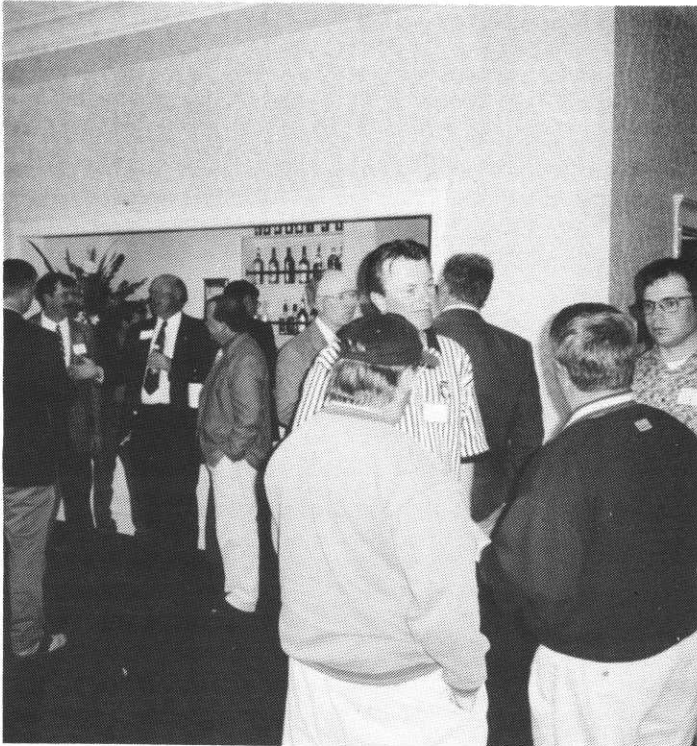
MGCSA members take a moment to socialize with their peers at the April 16th meeting at Bearpath G&CC.