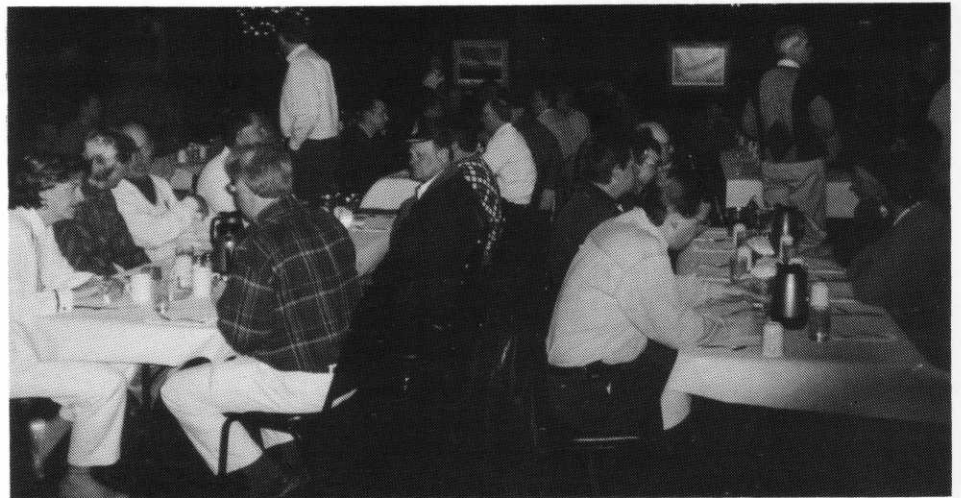
APRIL MEETING attendees enjoyed a nice lunch at Southern Hills.