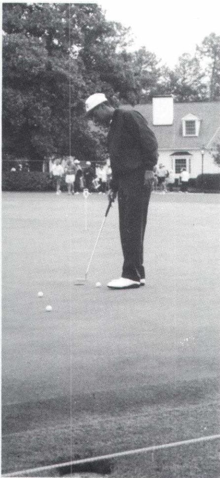
TIGER WOODS , U.S. Amateur champ, tries to get the feel of Augusta's greens.