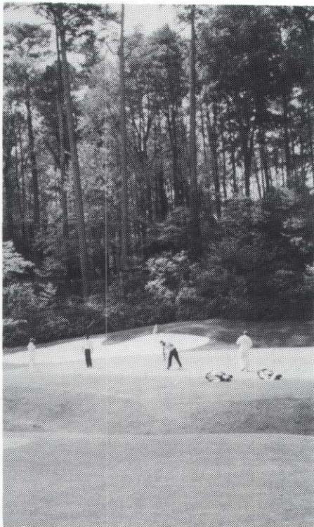
THE AZALEA HOLE at Augusta National