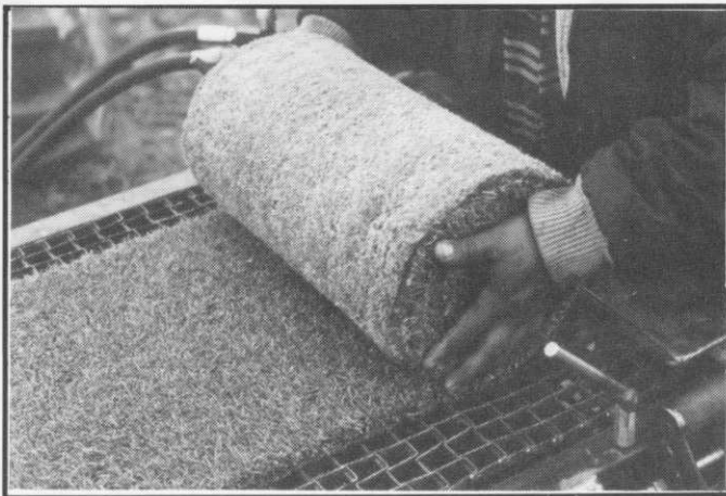
Wash Penncross Bentgrass

Minnesota's only washed Bentgrass supplier.