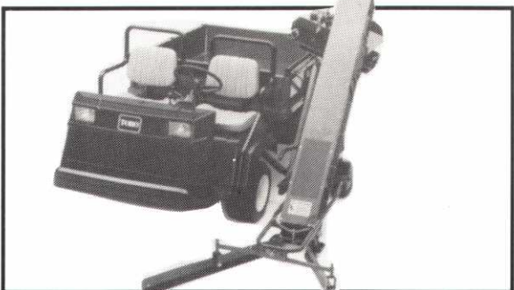
Toro Full Bed with Cushman® Core Harvester™