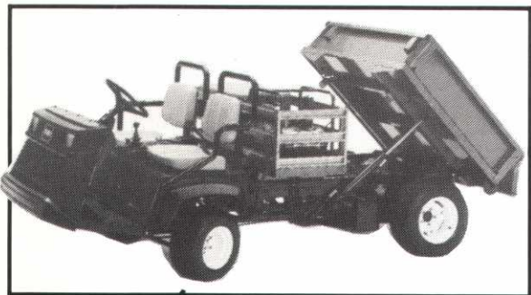
1/3 Bed with Stake Sides and 2/3 Dump Box

And It's Backed By Our Tradition Of Customer Satisfaction