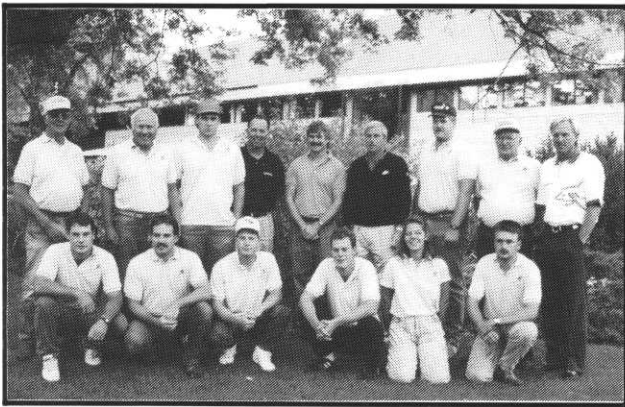
Dellwood Hill's Grounds Staff with their guests from the PGA.