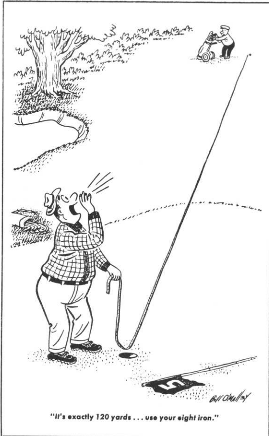
"It's exactly 120 yards... use your eight iron."