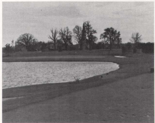
STEEPLECHASE. At Wedgewood Valley's 6th Hole just aim for the church and whisper a little prayer.