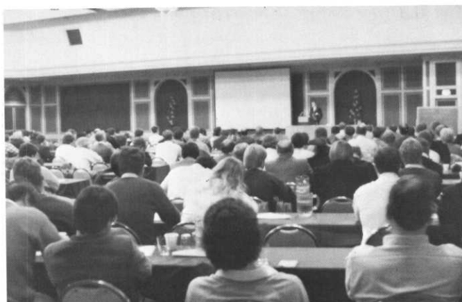
The Big Picture - New facilities at Radisson St. Paul offered comfort and style as well as function.