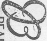
HOW IT WAS DONE AT MANKATO COUNTRY CLUB IN 1932