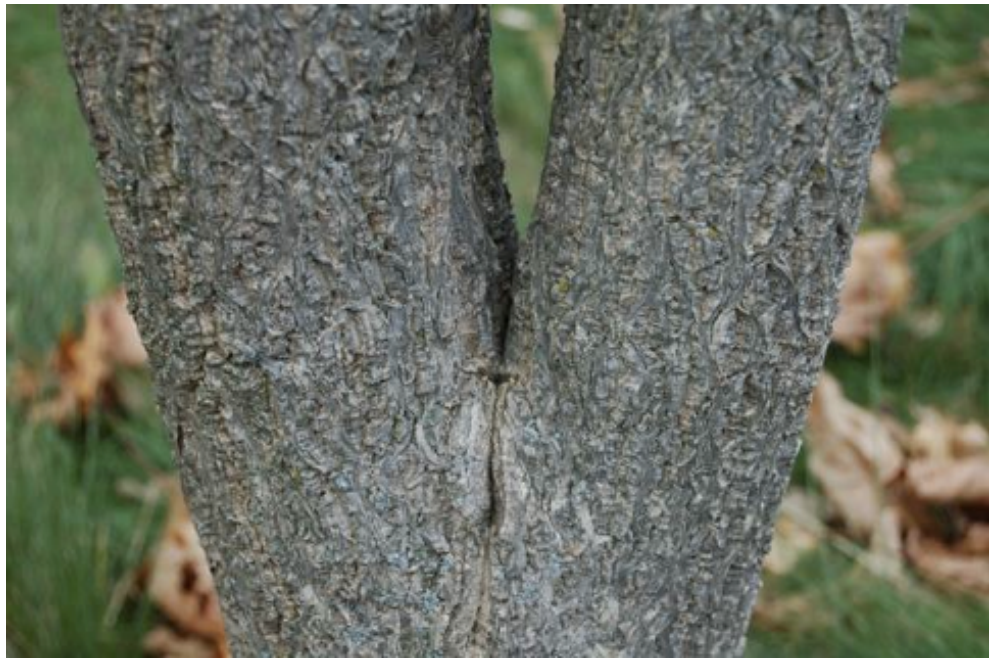
A good example of a branch union with included bark, literally, bark included in the attachment. This is weak.

Deadly Defect #6... Poor Tree Architecture. There can be a lot of architectural problems with unmaintained or