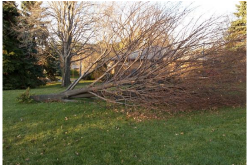
This little leaf linden failed suddenly in a wind storm, breaking off at the weak point of the tree trunk. The weakness was caused by stem compression from stem girdling roots. This tree was planted with the stem buried by more than 12" of soil.