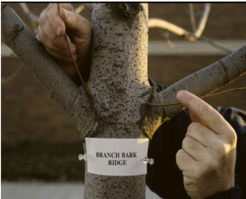
These branch attachments are strong. Note the prominent branch bark ridges, indicating strong branch unions.