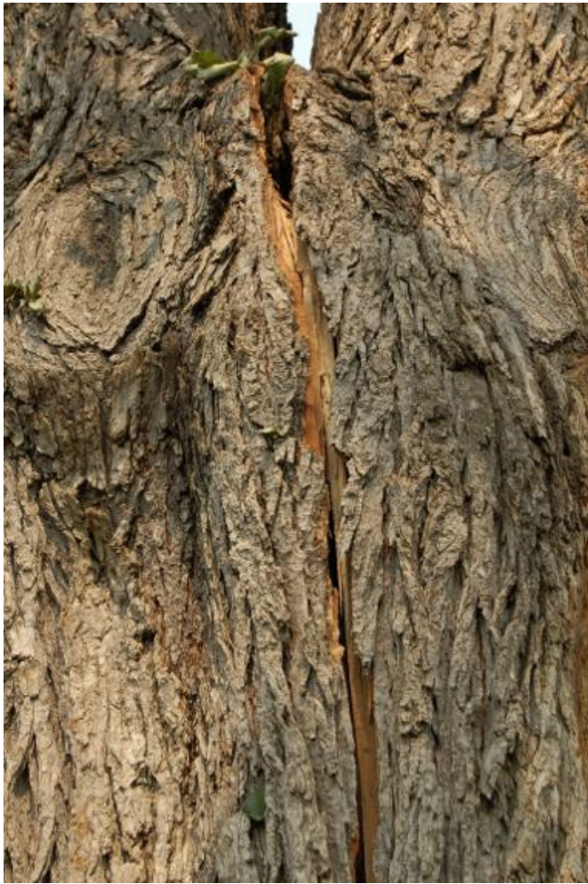
A close-up view of the crack and the internal damage that resulted from it. Soon, the wounded wood would begin decaying.