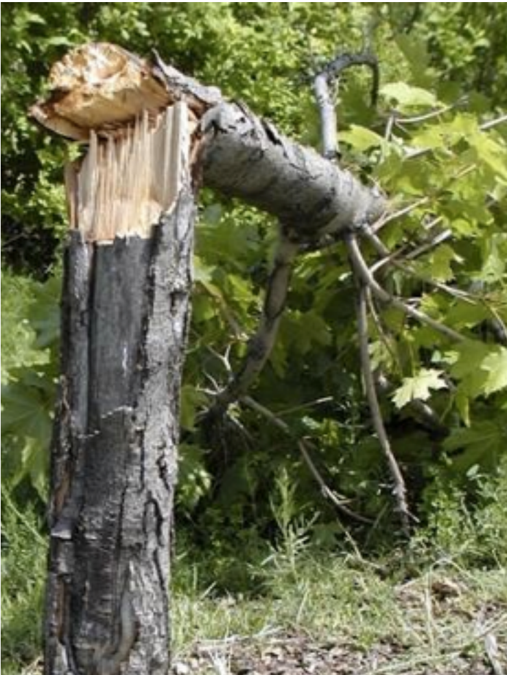
This young tree failed at a canker in the stem. The cause of the canker could have been a mechanical wound when it was younger. Regardless of the cause, the ending is usually the same with young trees.