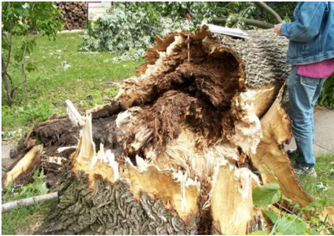
This basswood only had about 1.5 inches of solid wood in the trunk with the decay extending from the ground line up 20' into the tree trunk.