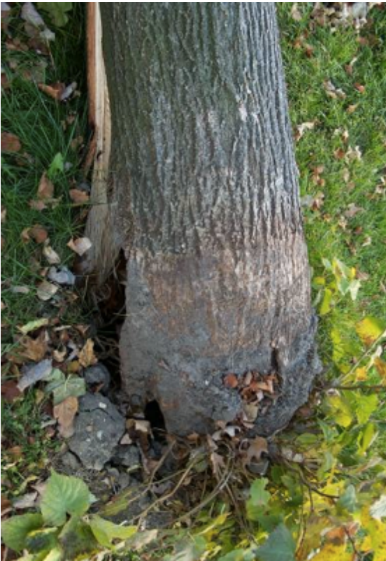
A close-up view of the buried tree trunk and the compressed, weakened portion below ground.