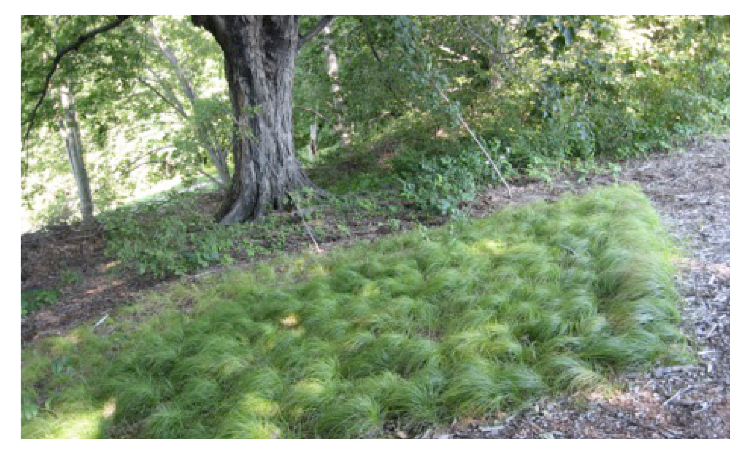
Shady, especially dry shade is difficult for most plants, however, the native oak sedge or Pennsylvania sedge is found in woods through Minnesota and the north central states. It grows easily in dry shade and grows only 8-12" tall. Plant Pa sedge along the edge of woods or a shady path and it will increase by rhizomes.

vegetation. It is often said that native species are fire tolerant; however, a more accurate phrase would be that our native species are fire dependant.