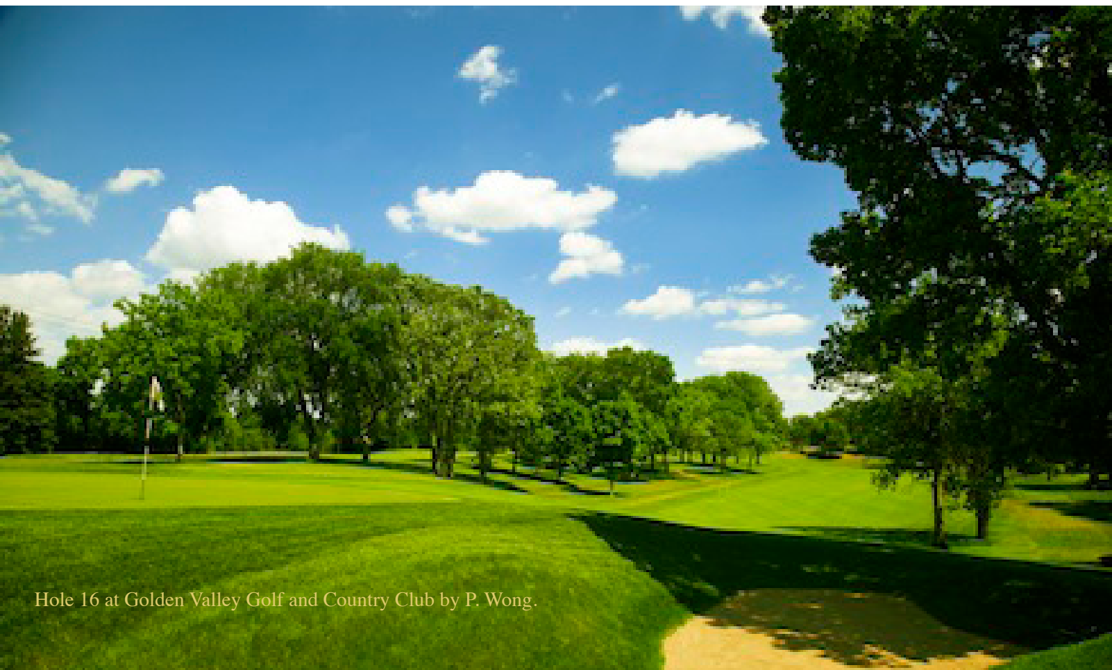
Hole 16 at Golden Valley Golf and Country Club

It is hard to believe that I am half way into my ninth year here