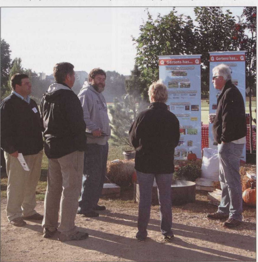
Hole Notes October 2011 27