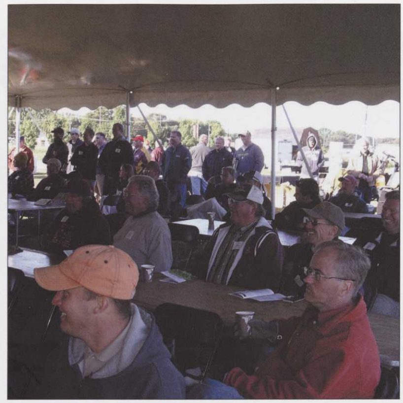
THE IMPRELIS HERBICIDE ISSUE, captured the attention of an interested crowd at the September 15 MTGF / UM Field Day at TROE Center in St. Paul.

(Editor's Note: Joe Spitzmueller can be reached at 651-201-6546 or joseph.spitzmueller@state.mn.us.