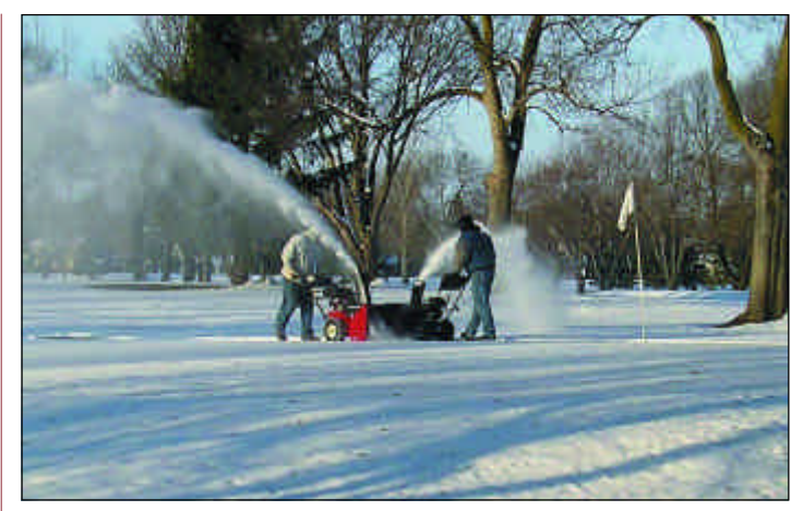
THE NEW PRAGUE GOLF CLUB GROUNDS STAFF must of had a feeling this was going to be a long winter as they did not want to put the course to rest in November 2010.

St. Charles Location 966 Wabasha Avo. • St. Charles, MN 55972 800-327-9066