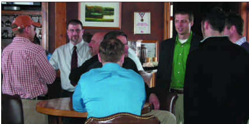
MGCSA members take a break during the March Mega-Seminar in the Legends Club grille in Prior Lake.