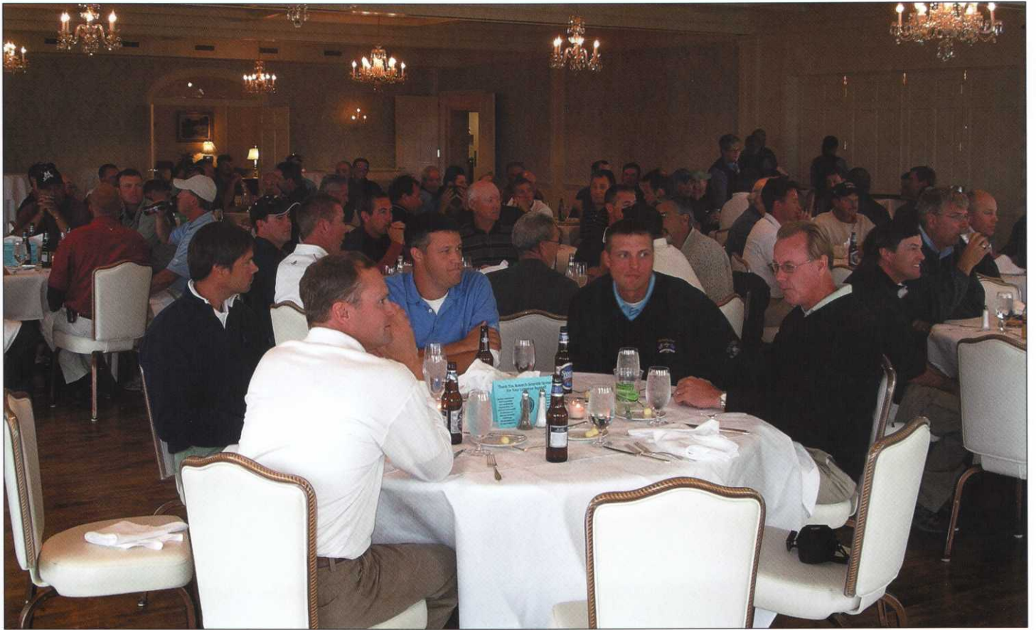
MGCSA members relaxed and enjoyed dinner at The Minikahda Club in Minneapolis after a great day of golf.