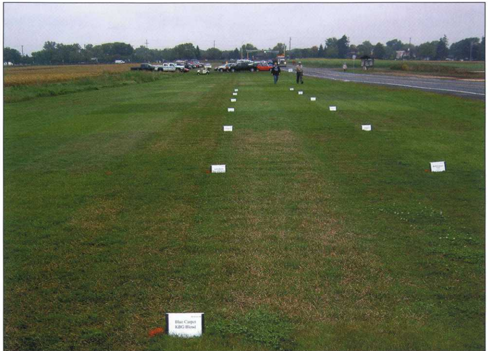
Fine Fescue Cultivars at the University of Minnesota.