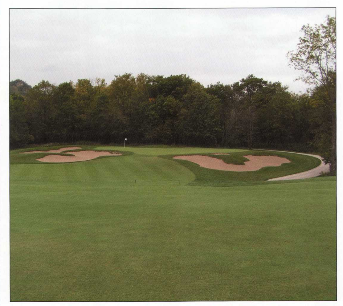
The 13th hole at The Jewel Golf Club in Lake City