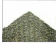
Local Competitor 15-5-10 (215 SGN)

1 lb. of N per 1,000 = 290 lbs/acre = 2.0 particles per sq. in.