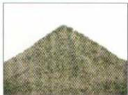
Andersons 25-3-9 + 2% Fe (150 SGN)

1 lb. of N per 1,000 = 175 lbs/acre = 3.7 particles per sq. in.