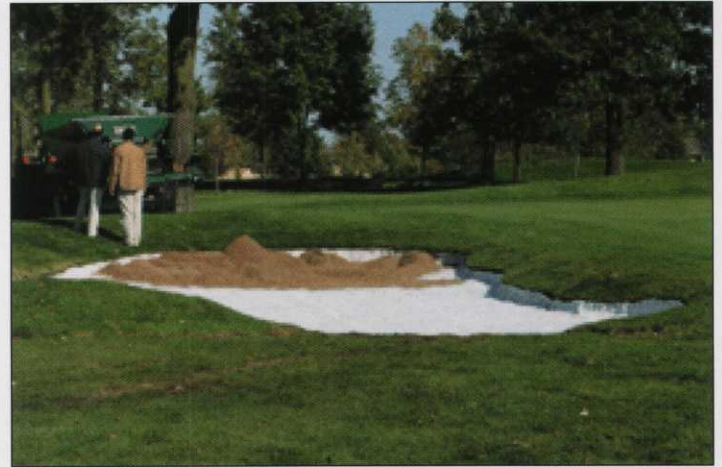
A greenside bunker on No. 10 at Monticello Country Club.