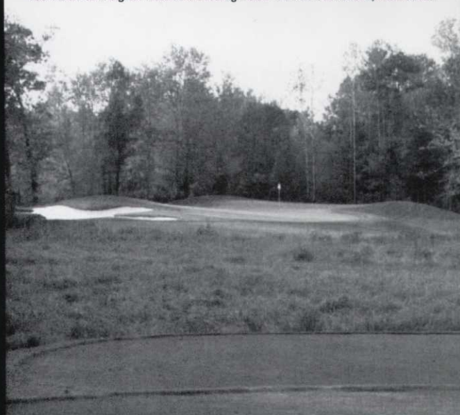
163 Yard Par 3 eighth hole at the Refuge Golf Club in Oak Grove, Minnesota.