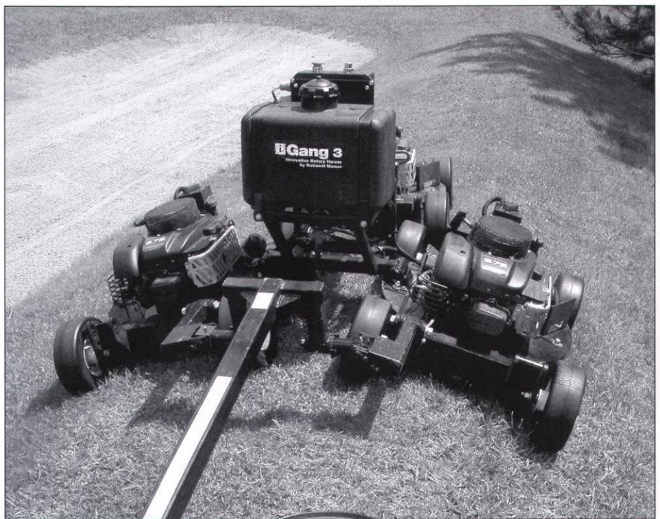
The I-Gang 3