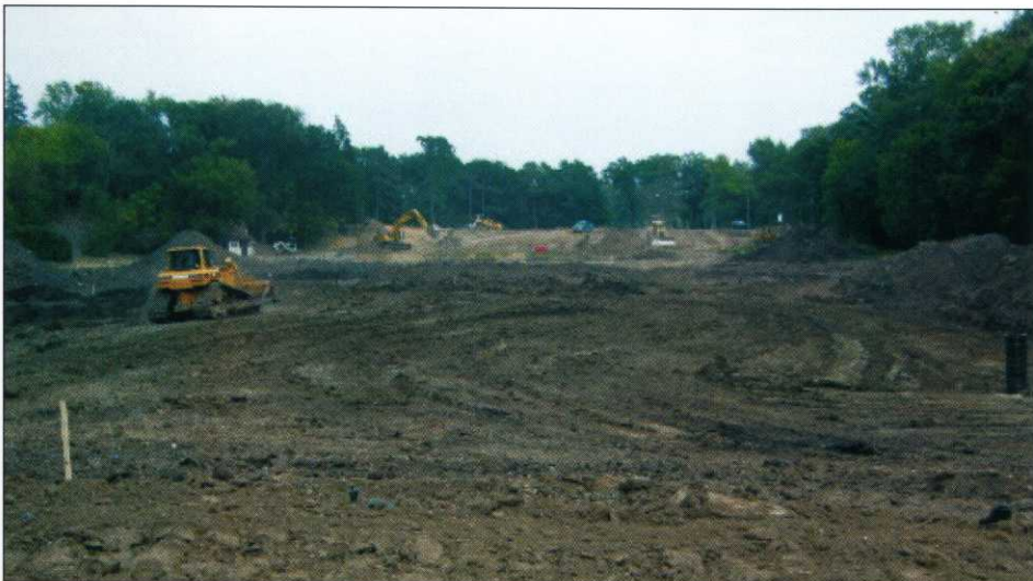
Big rigs at work.