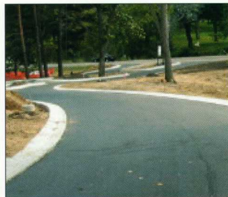
Interlachen's new entry drive.