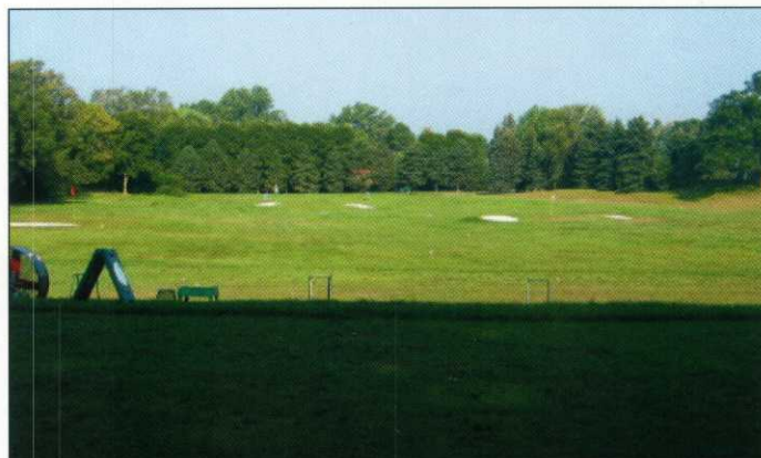
Ready for practice.