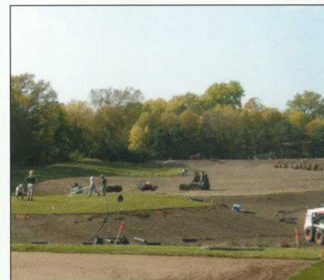
Constructing the target fairway.