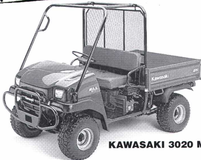
KAWASAKI 3020 MULE™