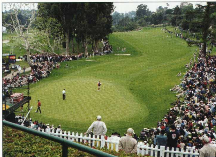
The eighteenth hole at Riviera at tournament time.