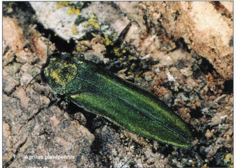
Figure 1. Agrilus planipennis Fairmaire

Adults are larger and a brighter green than any of the native North American species of Agrilus (Figure 1). The slender, elongate adults are 7.5 to 13.5 mm long, and females are larger than males. The adult body is brassy or golden green overall, with darker,