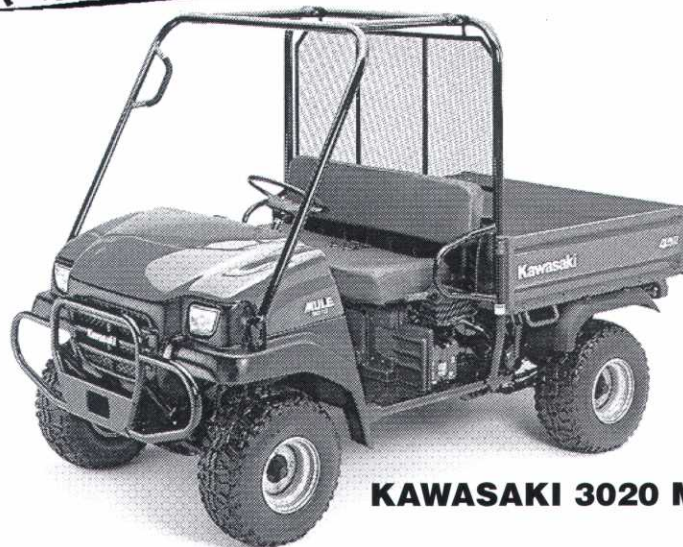
KAWASAKI 3020 MULE™